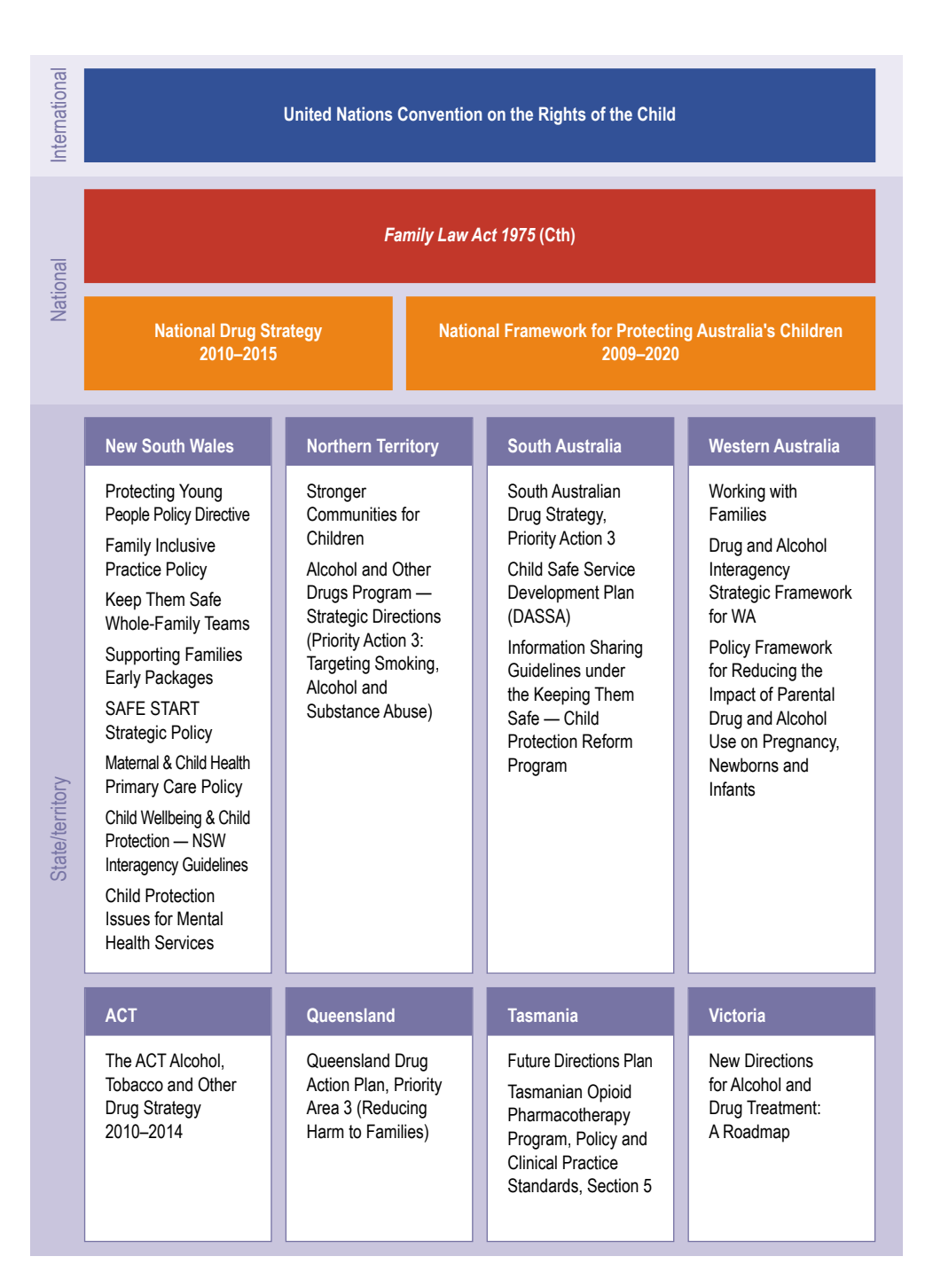
Figure 1: Examples of child and family sensitive policies at the international, national and state/territory levels