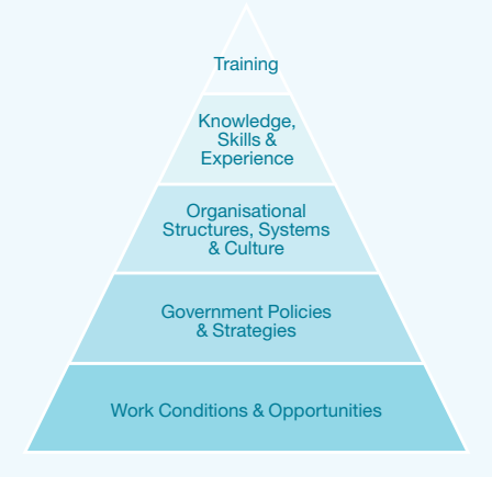
Figure 1. The different levels and components of workforce development

Not all WFD strategies can be implemented by organisations, managers or workers. Some require national or jurisdictional intervention. Examples include: the issue of accreditation, TAFE-university articulation, career pathways, and awards.