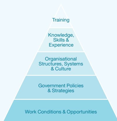
Figure 1. The different levels and components of workforce development

Not all WFD strategies can be implemented by organisations, managers or workers. Some require national or jurisdictional intervention. Examples include: the issue of accreditation, TAFE-university articulation, career pathways, and awards.