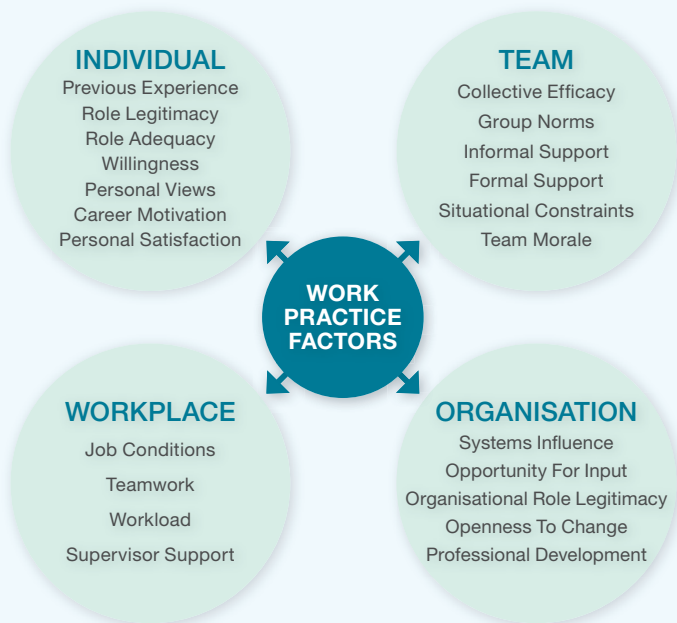
Figure 3. Multiple levels of WFD intervention required to achieve work practice change

Examples of resources on AOD workforce development include the following from NCETA