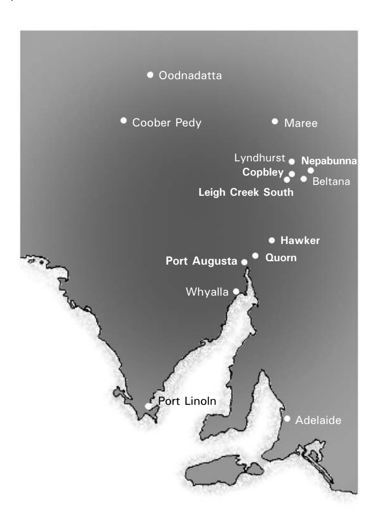
Fig 1: Current location of the RAISE Wellbeing program (Pt Augusta, Quorn, Hawker, Leigh Creek, Copley & Nepabunna)

A specialist senior mental health worker has been employed by the Regional Mental Health Program and who is currently working in the Pika Wiya Health Service to lead the Social & Emotional Wellbeing Team. A further project officer commenced in 2005 on a short-term contract to develop linkage processes that will facilitate the partnership.